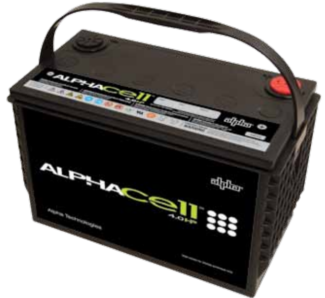
AlphaCell™ 4.0 HP